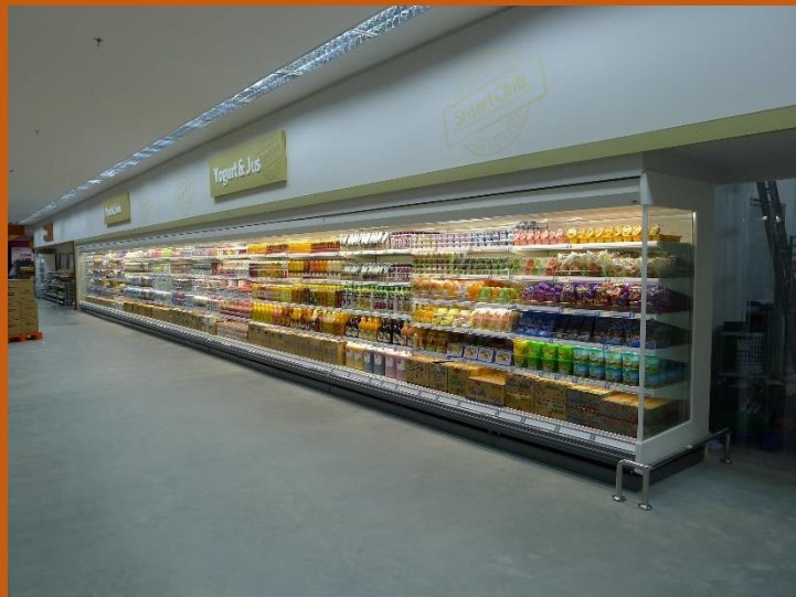
Our Chiller & Freezer