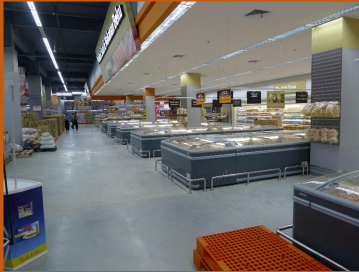
Our Chiller & Freezer